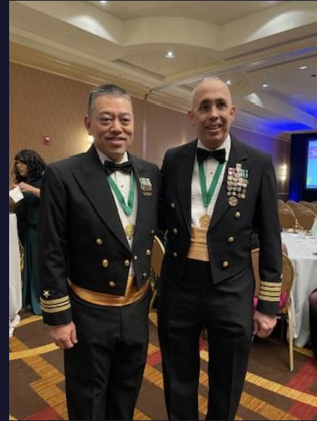
Three AMAZING (Simultaneous) Careers!