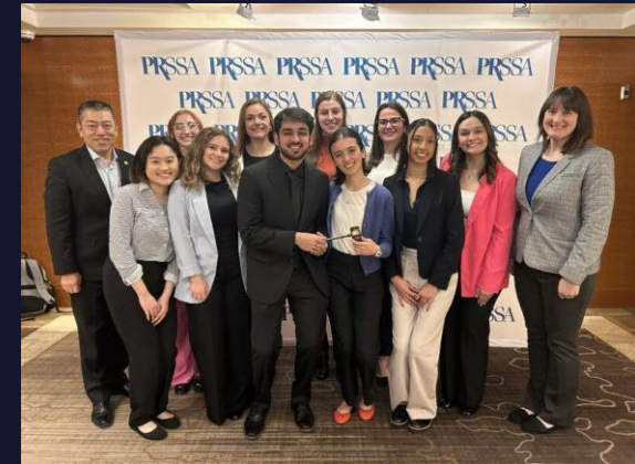
Leadership opportunities – locally and nationally