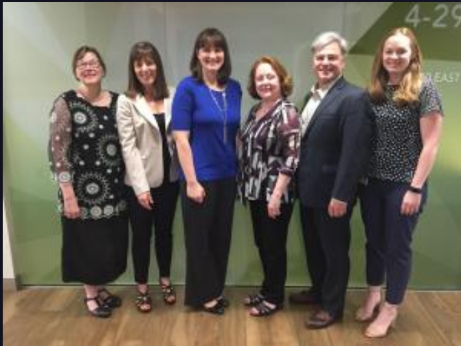
Mentors locally and nationally