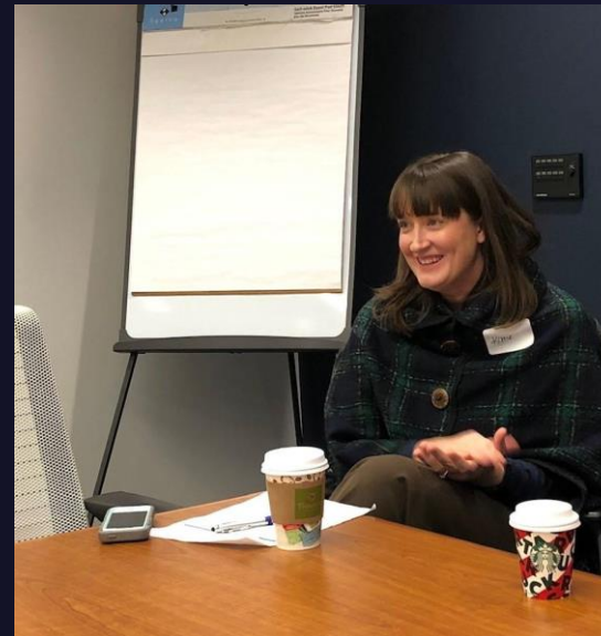
Professional development – locally and nationally